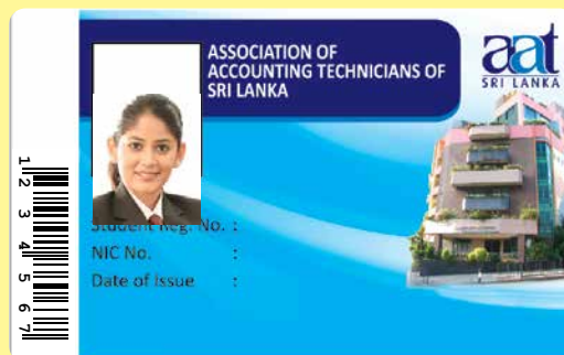
(Format of a Student Identity Card)

It will be useful for all students to use a clear signature and initials separately as may be required.