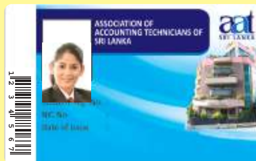
(Format of a Student Identity Card)

It will be useful for all students to use a clear signature and initials separately as may be required.